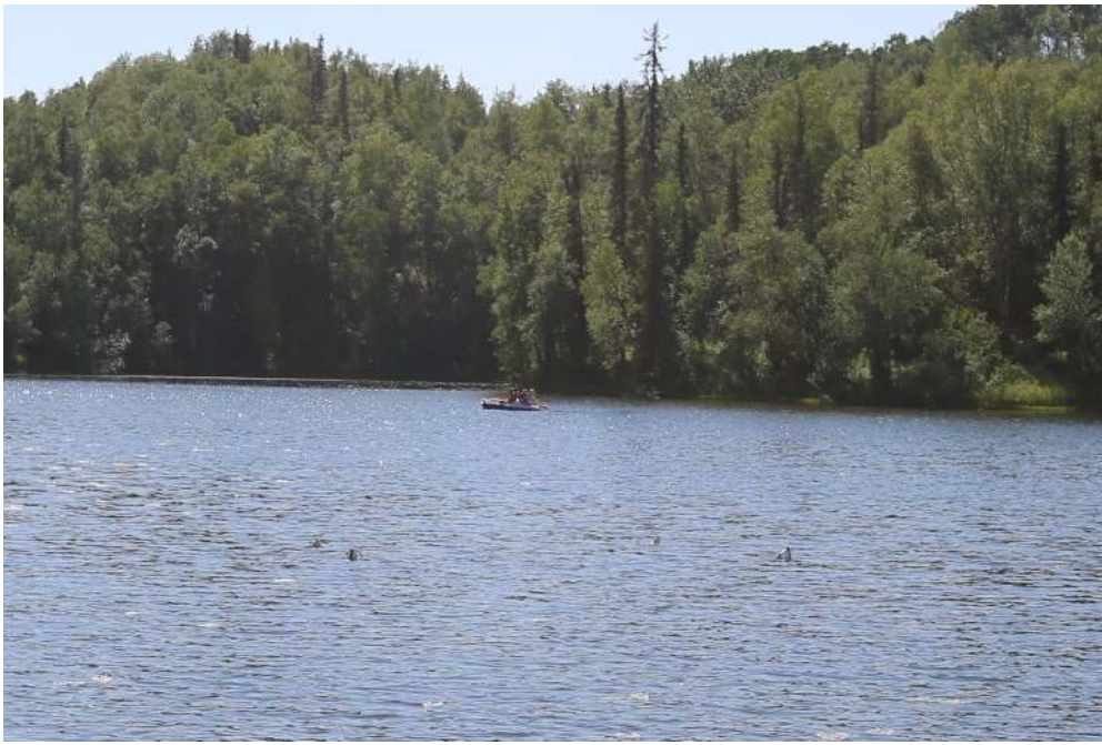
Girls having fun at rec on the lake