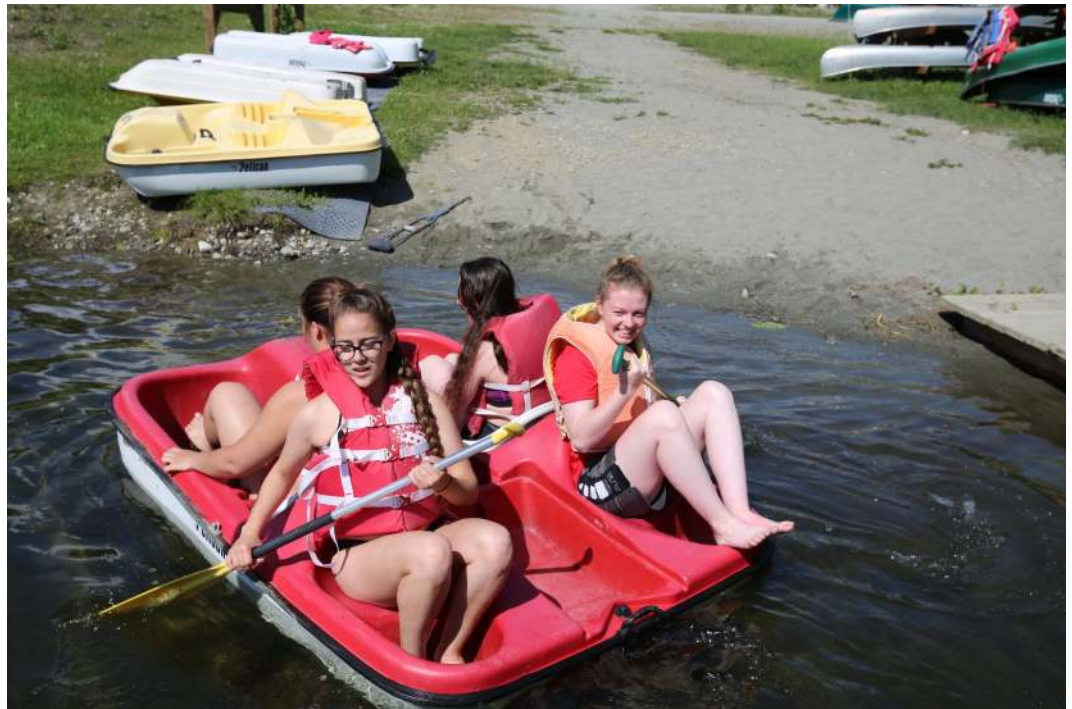
The girls going for a boat ride