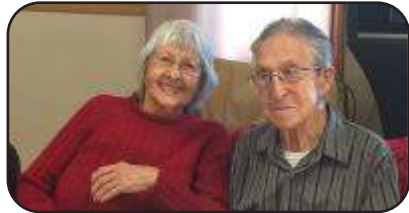
Together for 75 years