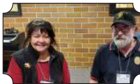
A couple of our much loved Christmas elves!