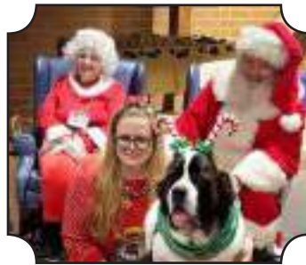
Mr. Claus and Mrs. Claus. An elf and Rudolph ?